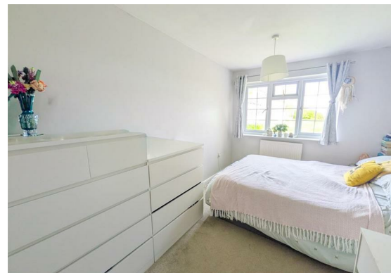
Bedroom 3 9'6 x 7'1 (2.90m x 2.16m )